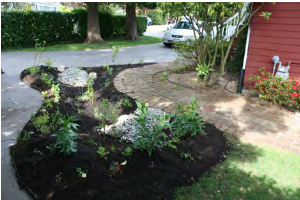
Rain Garden at a Burien Home