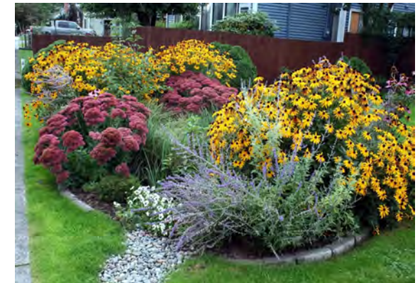
Rain Garden at a Puyallup Home