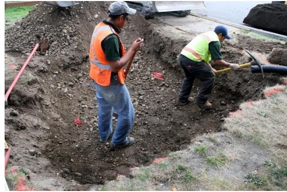
Rain Garden Excavation – JBLM