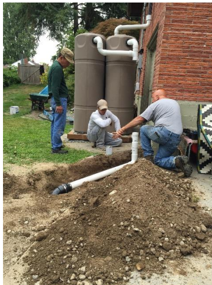
Rain Tank Install - Seattle