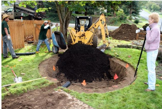
Rain Garden Construction – Puyallup