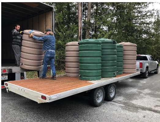
Rain Tank Delivery – Storage Yard