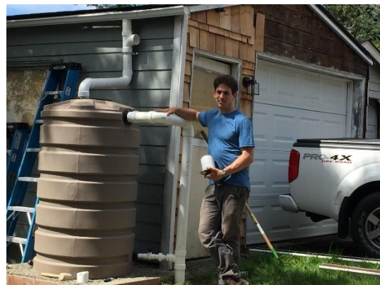
Rain Tank Install – Seattle