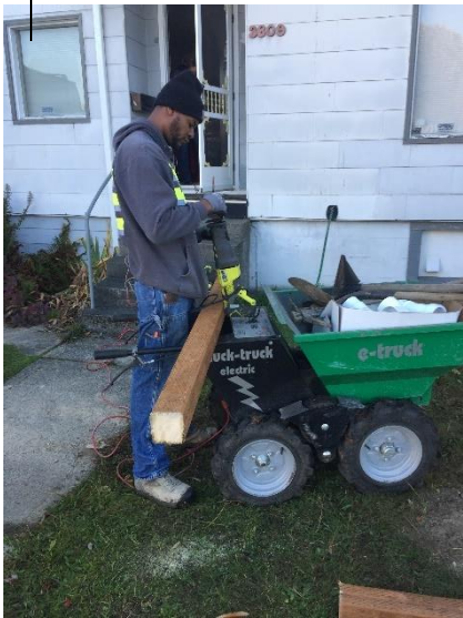
Rain Tank Install - Tacoma